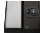
On/Off Switch with 100%/50% Dimming Color Temp. Switch: 2700K/3000K/4000K