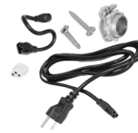
6' Power Cord 8' interconnect cable End-to-End connector Mounting screws