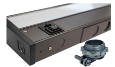
1/2" KOs Cable Connector Included